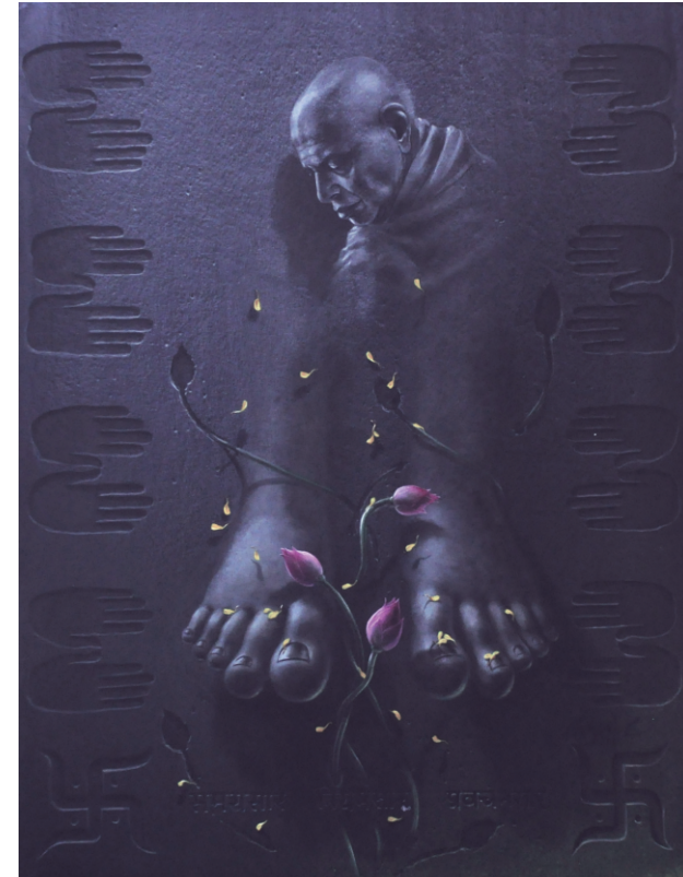
Gopal Chowdhury | 3ft x 4ft | Acrylic on Canvas