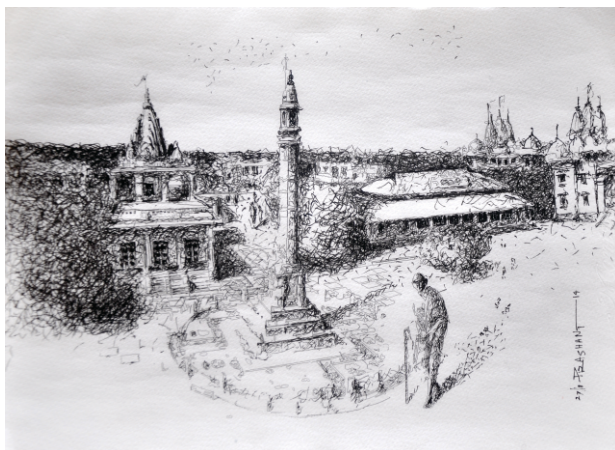
Prashant Shah | 11" x 17" | Ink on Paper