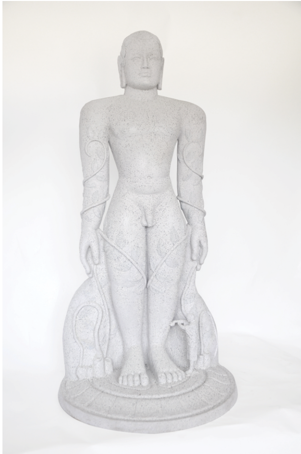
Chandrashekar Khanzode | 57"x 29"x 29" | Glass fiber