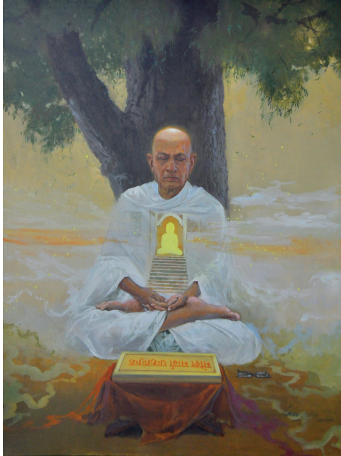
Vasudev Kamat | 3ft x 4ft | Acrylic on Canvas