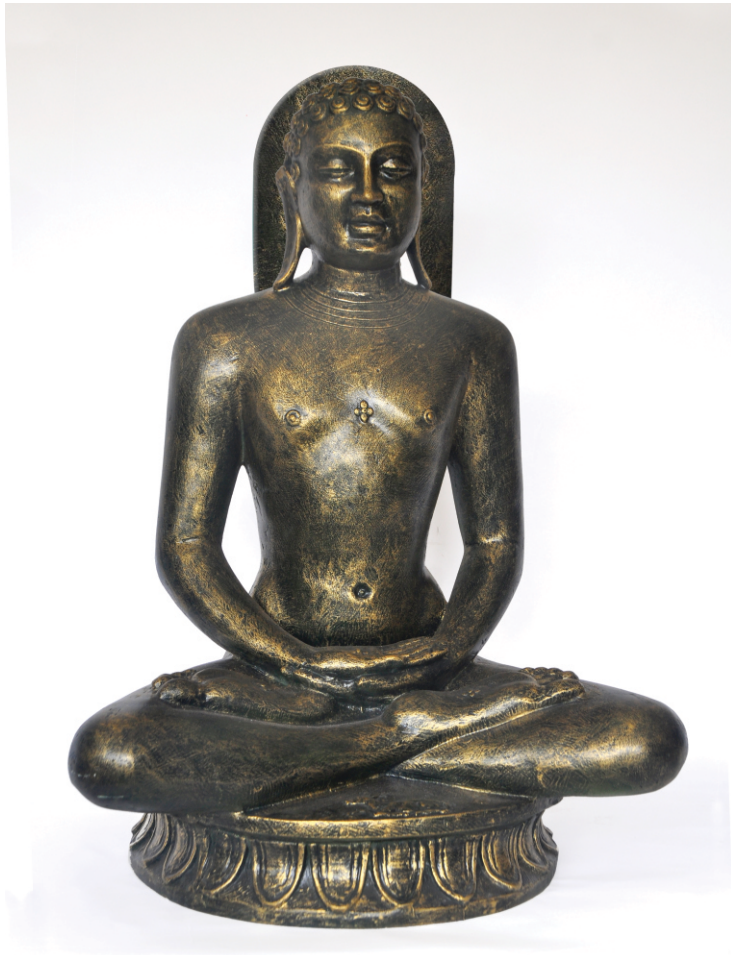
Amit Sawant | 37"x 26"x 24" | Glass fiber in colour