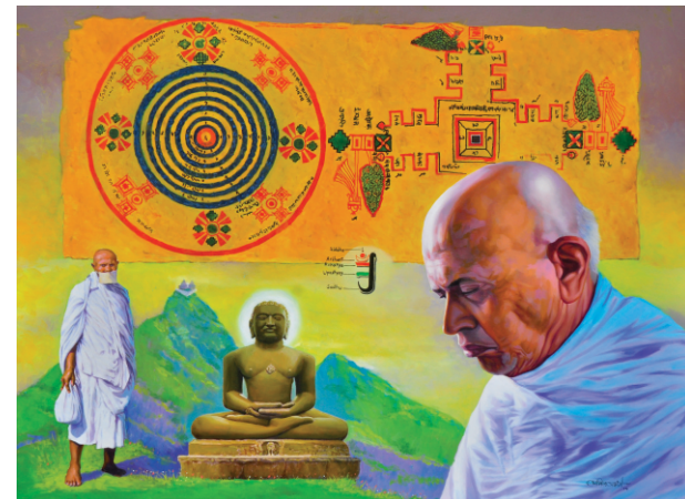
Anil Abhange | 3ft x 4ft | Acrylic on Canvas