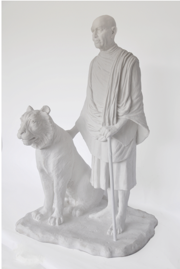
Pramod Kamble | 51"x 31"x 30" | Glass fiber