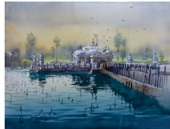
Prafull Sawant | 15" x 20" | Water Colour on Paper