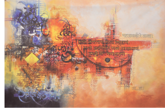
Ram Kasture | 7ft x 9ft | Acrylic on Canvas