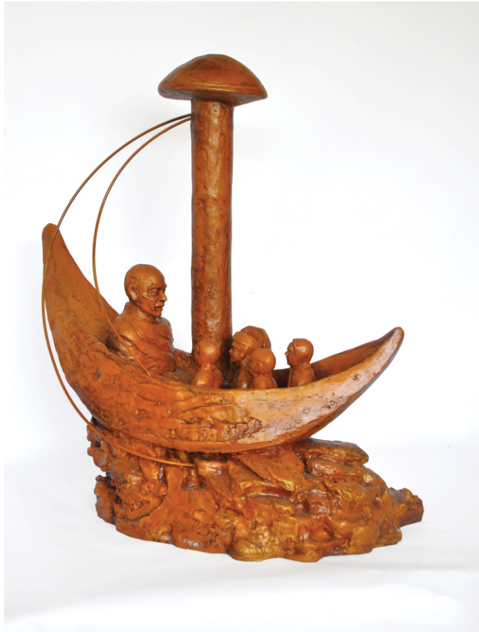
Madhukar Wanjari | 32"x 33"x 17.5" | Glass fiber in colour