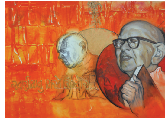
Anil Naik | 3ft x 4ft | Oil on canvas