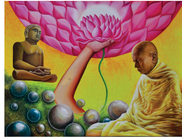
Kanu Patel | 3ft x 4ft | Acrylic on Canvas