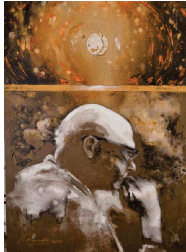
Ananta Mandal | 3ft x 4 ft | Acrylic on Canvas